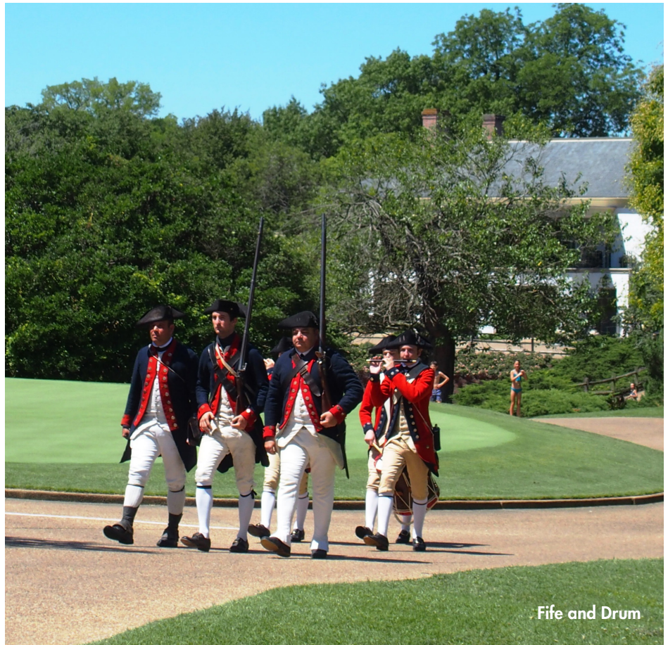
Fife and Drum

www.colonialwilliamsburg.com/explore/golf