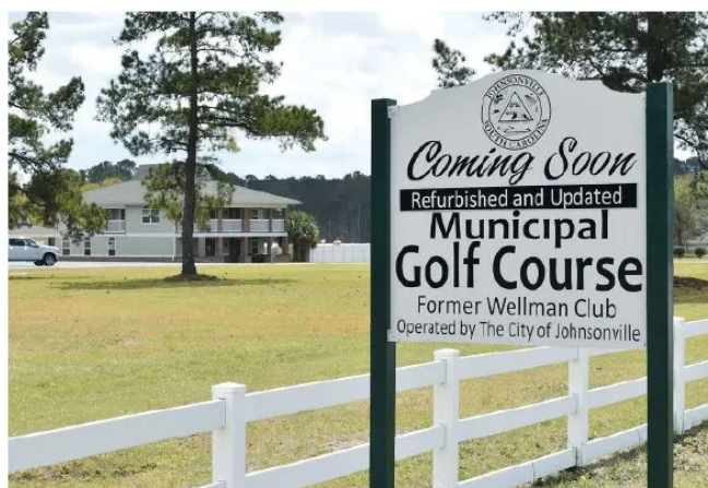
The Wellman Club sat idle for more than a decade but, as the sign indicates, is about to be born anew.